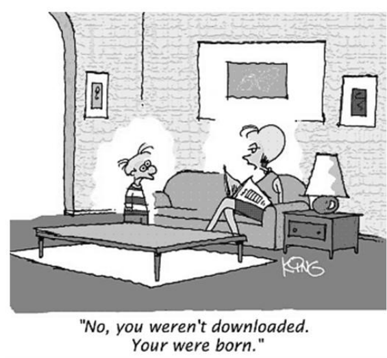
Figura 1. A typical figure

be placed before the table (see Table 1) and the font used must also be Helvetica, 10 point, boldface, with 6 points of space before and after each caption.